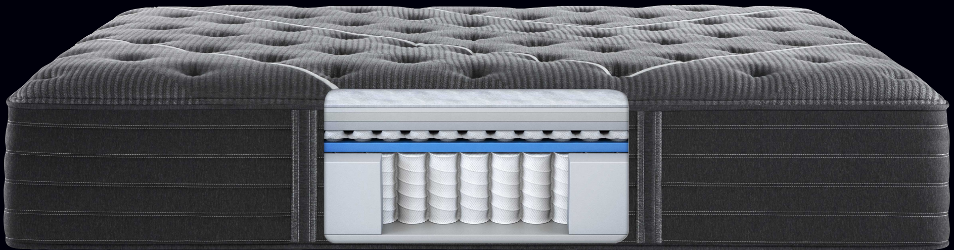
Illustration shows K-Class™ Medium. Other models will vary.

*This product does not protect users or others against bacteria, viruses, germs or other disease organisms.